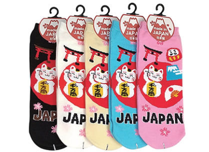
NO.UO9930 QUA. C.A.Pe.N.Pu 入荷済 ラッキーチャーム JAN 4993645482309