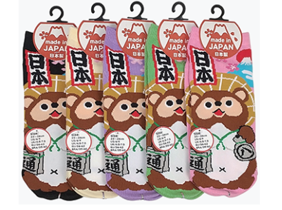
NO.UO9929 QUA. C.A.Pe.N.Pu 入荷済 たぬき JAN 4993645482293