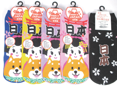
NO.UO9917 QUA. C.A.Pe.N.Pu 継続中 柴犬と舞妓さん JAN 4993645482170