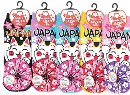
NO.UO9924 QUA. C.A.Pe.N.Pu 継続中 番傘に招き猫 JAN 4993645482248