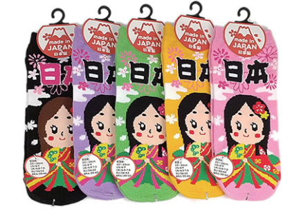
NO.UO9923 QUA. C.A.Pe.N.Pu 継続中 十二単 JAN 4993645482231