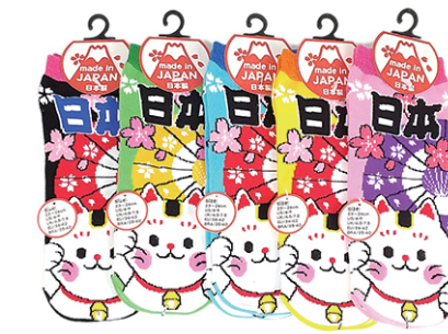
NO.UO9926 QUA. C.A.Pe.N.Pu 継続中 番傘を持つ猫 JAN 4993645482262