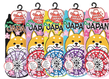
NO.UO9925 QUA. C.A.Pe.N.Pu 継続中 番傘に柴犬 JAN 4993645482255