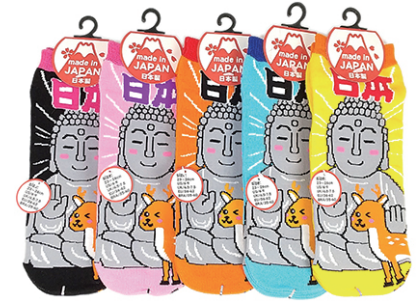
NO.UO9922 QUA. C.A.Pe.N.Pu 継続中 大仏 JAN 4993645482224