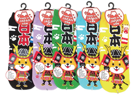
NO.UO9918 QUA. C.A.Pe.N.Pu 継続中 かぶと柴犬 JAN 4993645482187