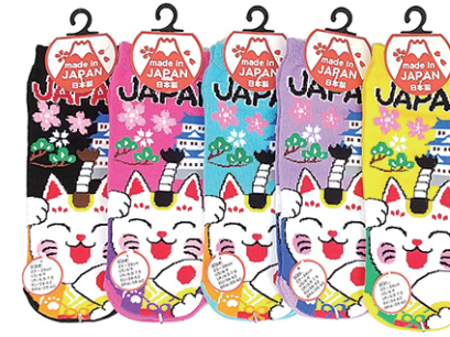
NO.UO9920 QUA. C.A.Pe.N.Pu 継続中 ちよんまげ招き猫 JAN 4993645482200