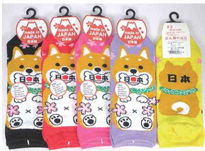
NO.UO9916 QUA. C.A.Pe.N.Pu 継続中 くわえる柴犬 JAN 4993645482163