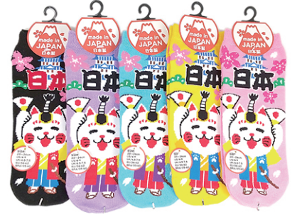
NO.UO9921 QUA. C.A.Pe.N.Pu 継続中 ねこ殿 JAN 4993645482217