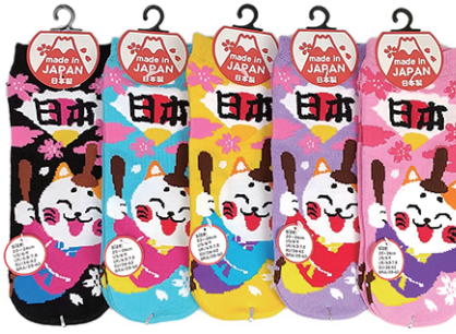
NO.UO9919 QUA. C.A.Pe.N.Pu 継続中 ねこ麻呂 JAN 4993645482194