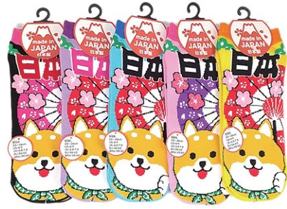
NO.UO9927 QUA. C.A.Pe.N.Pu 継続中 番傘を持つ柴犬 JAN 4993645482279