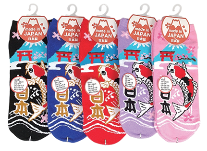
NO.UO9928 QUA. C.A.Pe.N.Pu 継続中 鯉と富士山 JAN 4993645482286